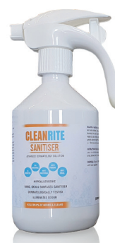
CLEANRITE 500ML WITH VAPORISER